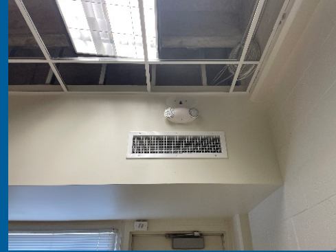
Emergency Lights installed in classrooms