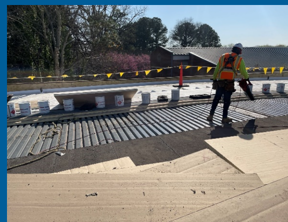
D-West Roof prepping