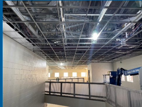
Ceiling Grid Installed in Gym