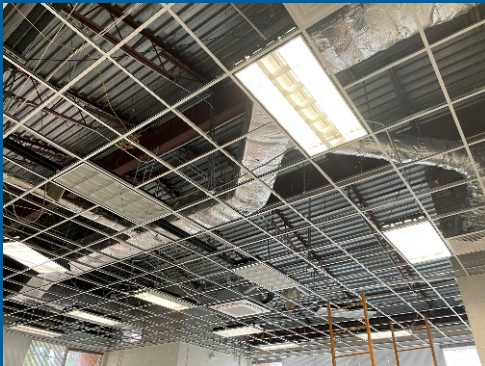
Installing light-fixtures into ceiling grid