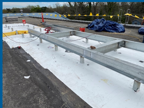
Roof top HVAC unit support steel installed