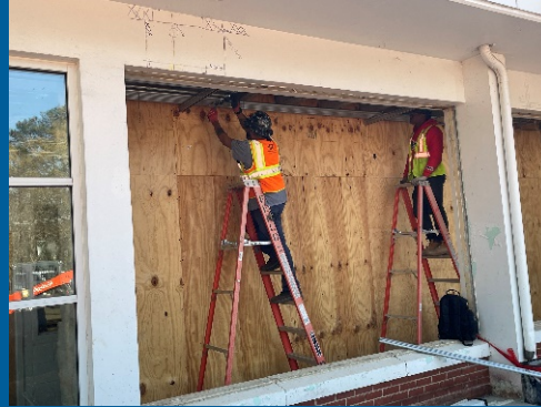
Electrical Rough-ins installed in secure vestibule